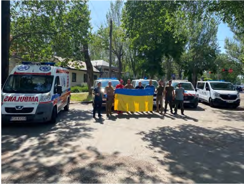
Ambulances donated by Singapore Red Cross being received by URCS, Mykolaiv Regional Branch in Ukraine

As the need for medical services and transport increases, SRC in partnership with the Ukrainian Club in Singapore worked together to procure and deliver 10 ambulances to Mykolaiv, a region in Ukraine that is close to the frontline and frequently under siege. Over a period of 2 months, the ambulances have served almost 250 patients in Mykolaiv who were injured as a result of the ongoing conflict.