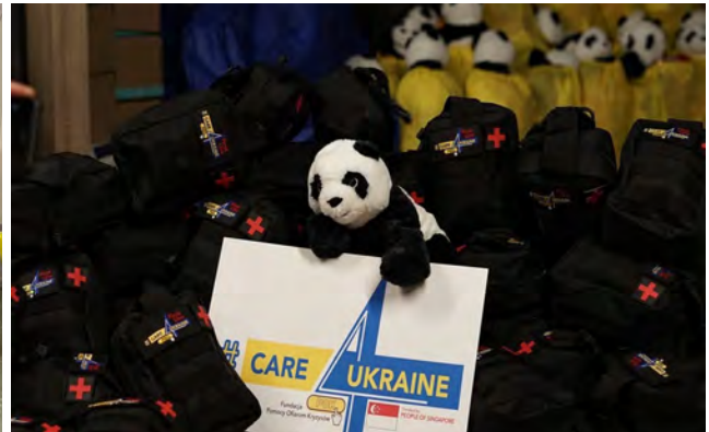
(left) Meal with Love beneficiaries; (right) trauma packs for individual responders