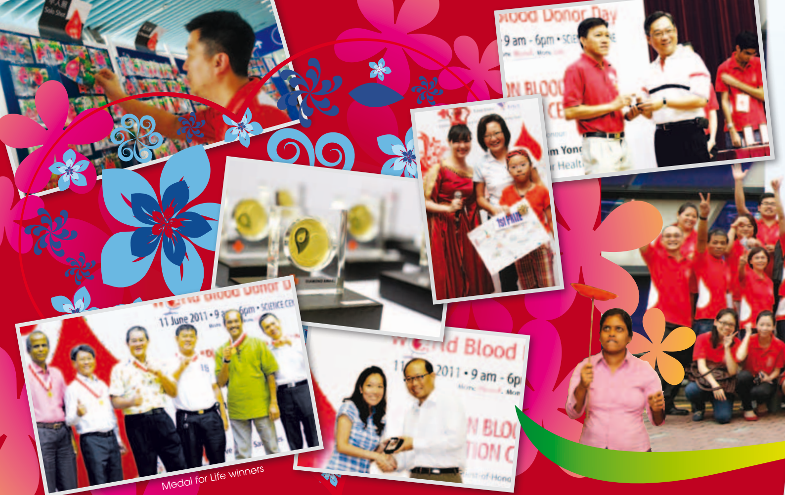
Medal for Life winners